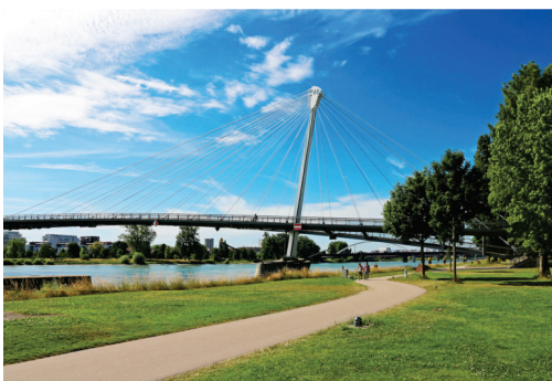
Two Shores Footbridge