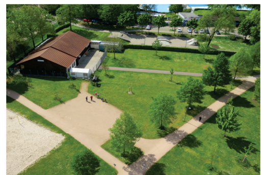
Felscheune in Kehl